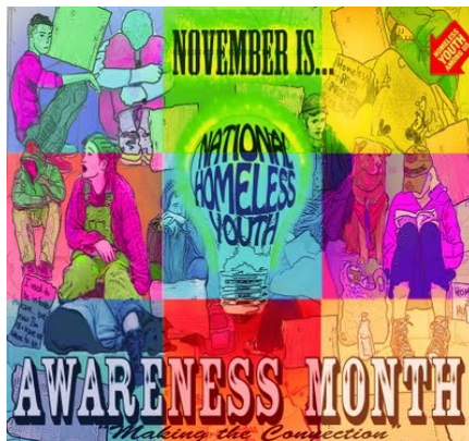
2011 Youth Mural Project

The YLT also participated in the Grand Opening of Urban Peak’s drop in shelter in Denver. This inspired our youth to want to advocate for similar services in GarCo.